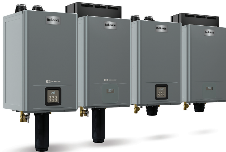
X3, X3 w/Vent Cap Kit, M, M w/Vent Cap Kit

in practically any residential setting, indoor or out.